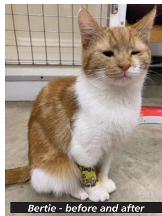
Bertie - before and after

We can only care for cats like Bertie with your support, whether it be a donation, playing the Paws Lottery or buying our pet hampers.