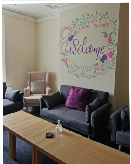
Pictured: New meeting room with wonderful wall art.

We had some wonderful artwork created on one of the large wall spaces by Just Another Sign of The Times , and we are sure you will agree it certainly adds a lovely touch to the room. Other rooms in the building have also been treated to the amazing designs created by the very talented, Danielle.