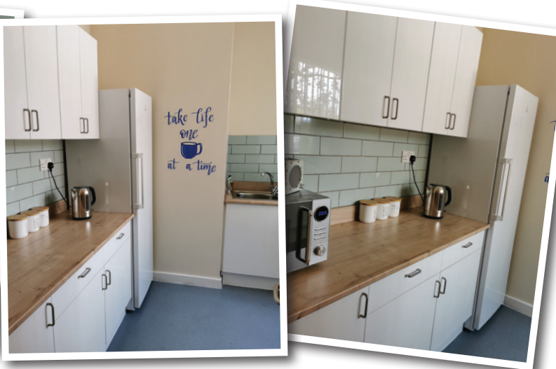
Pictured: Completed kitchen looking fantastic, thanks Darren!