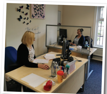
Pictured: Our newly transformed Safe Haven Rooms