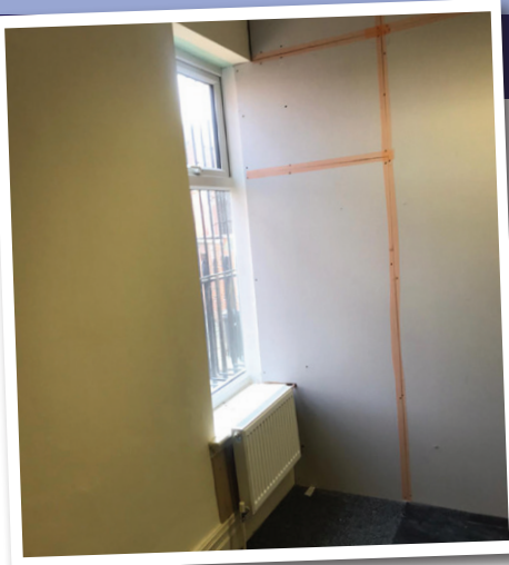
Pictured: Counselling & Safe Haven before

We now have a wonderful counselling room that has been created as a calm and welcoming environment. Again a room was divided and new walls were built to create a purpose built peaceful and welcoming space for the counsellors to use.