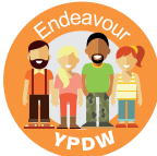
Young Persons Development Worker