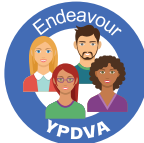
Young Persons Domestic Violence Adviser